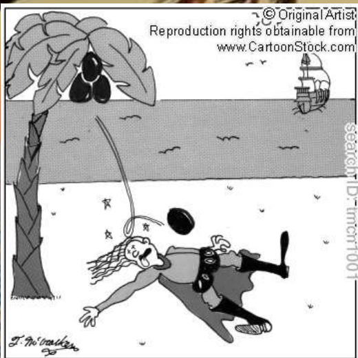
Two hundred years before Newton, Columbus discovers gravity in the New World.